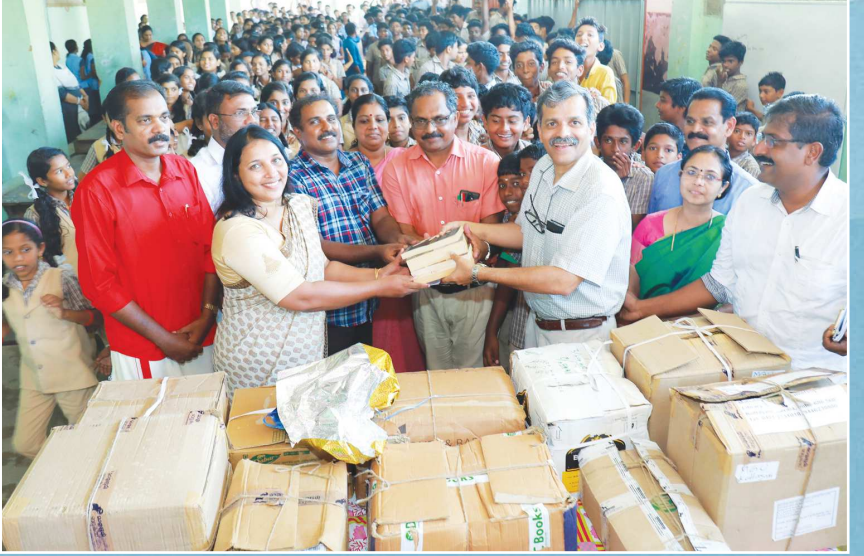
Snehaksharam: Handing over of books to rebuild library