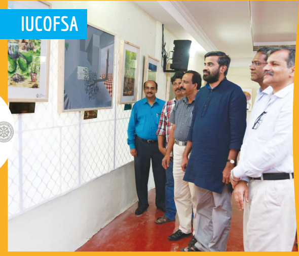
'Jaivam' Painting Exhibition