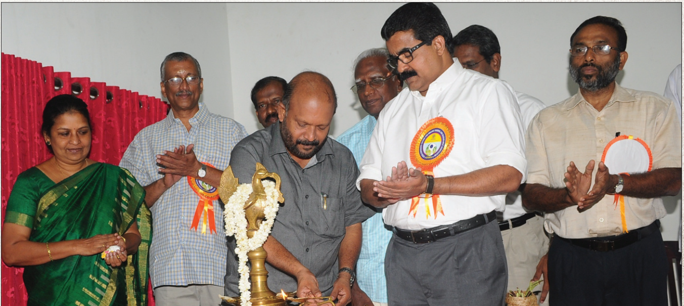
Jaivam: Inauguration of State Level training programme by Adv. V.S. Sunil Kumar Hon'ble Minister for Agriculture