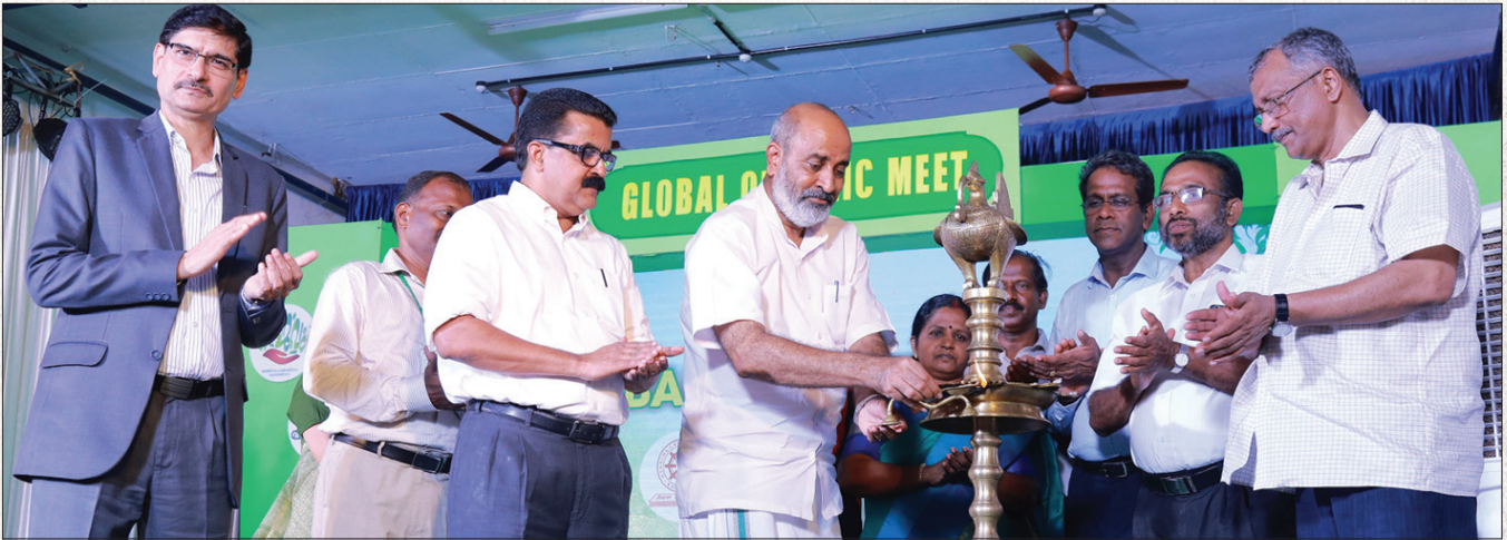
Global Organic Meet Inauguration by Adv. Mathew T. Thomas, Hon'ble Minister for Water Resources