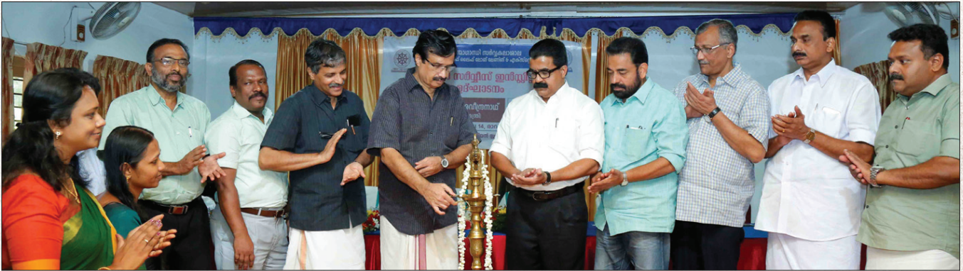
Inauguration of Civil Service Institute by Prof. C. Raveendranath, Hon'ble Minister for Education