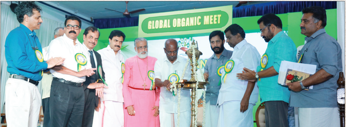
Global Organic Meet: Valedictory Session Inauguration by Sri. M.M. Mani, Hon'ble Minister for Electricity