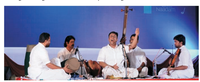
Sanjay Subrahmanyam in a recital