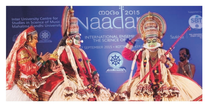
Kalamandalam Gopi in' Karnasapatham'

musicians from India and abroad performed live. There was also a demo cum exhibition of various musical instruments showing the evolution and historical setting of the instrument.